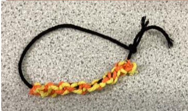
Rakhi bracelet (Year 4)