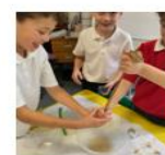
Small intestines and large intestines