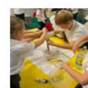
Stomach and intestines