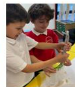
Oesophagus + stomach