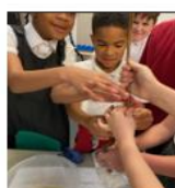
Small intestine and large intestine, rectum, anus + toilet!

In Science we have been looking at living things, how we keep our teeth healthy and our digestive system. We even made some poo using bananas and tights - it got very messy!