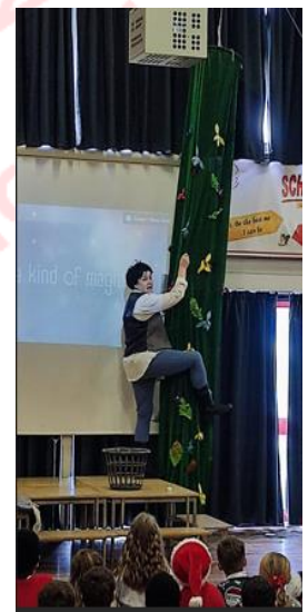
The cast on stage!